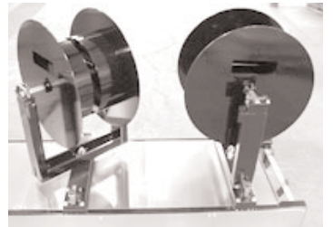
Turnstile Reel Stand