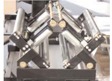
Spin Coil Cradle