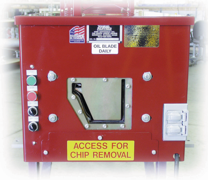
Front pull guillotine